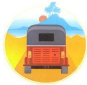
Roads Less Travelled Lanka

(1) Mark No.: 200624; (2) Date of Receipt: 01/09/2015; (3) Priority claimed:—; (4) Name and address of the applicant: ROADS LESS TRAVELLED LANKA (PRIVATE) LIMITED, 216, De Saram Place, Colombo 10, Sri Lanka; (5) Address for service in the Island: M/s. Nithya Partners, 97A, Galle Road, Colombo 03; (6) Class: 43; (7) Goods or services: 43 services for providing food and drink; temporary accommodation; (8) Representation of the mark: