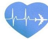
Medical Tourism (Pvt) Ltd.

(1) Mark No.: 207396; (2) Date of Receipt: 12/05/2016; (3) Priority claimed:—; (4) Name and address of the applicant: MEDICAL TOURISM (PVT) LTD, No. 30/3/2, Maharagama Road, Piliyandala, Sri Lanka; (5) Address for service in the Island: E-Law Solutions (Private) Limited, No.104, Royal Pearl Garden, Alwis Town, Wattala; (6) Class: 44; (7) Goods or services: 44 Medical tourism and medical services; (8) Representation of the mark: